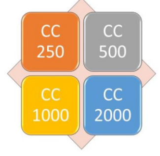
Option of 4 bottling capacities