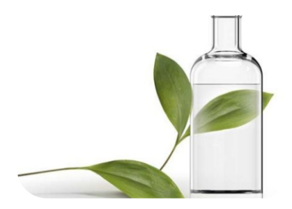
Branded and Green labelled Bottles