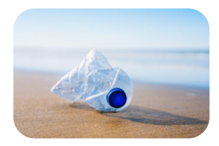
Elimination of Pet Bottles