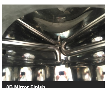
8B Mirror Finish